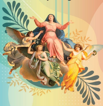
The Assumption of the Blessed Virgin Mary